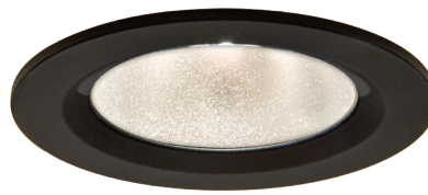
BK- Black Powder Coat GB2