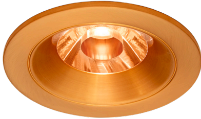
CB- Brushed Copper GL3