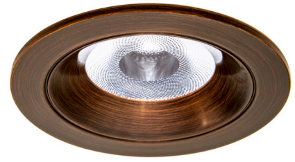
BZ- Oil-Rubbed Bronze GL3