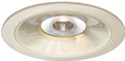
NC- Polished Nickel Chrome GL4