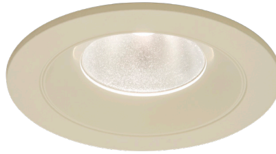
WH- White Powder Coat GB3