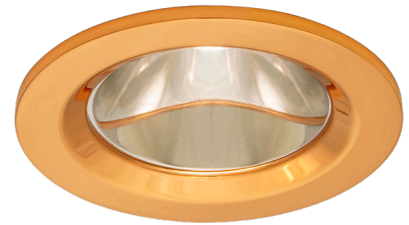
CU- Polished Copper GB2