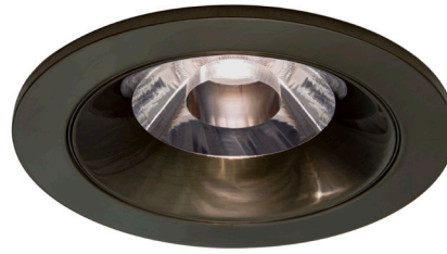
BC- Black Chrome GL3